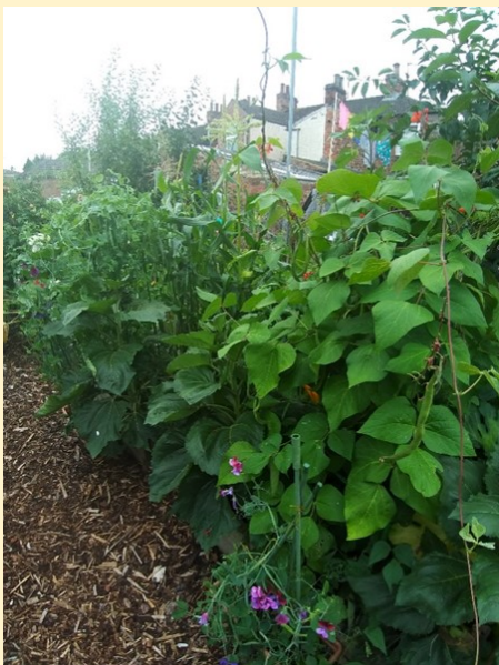
Jungle land behind Extons Road

That said, the allotment is so full of growth that it could be used as a film set for Tarzan in the jungle!