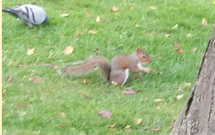
..... and what she was looking at!

There is not really anything much else to report on in relation to parish life – which is pretty normal for this time of year. It is peak holiday season and not much else happens. That said, last Saturday our First Holy Communion children had their final class and we now look forward to the First Holy Communion Mass on Sunday 5 th September, which might sound a long way off but in fact it is just over 5 weeks away. This year’s class have been extremely diligent in attending both their classes and Mass, and in doing some of the “homework” that their course workbook suggests for each week. They have done really well and we look forward to their “big day”.