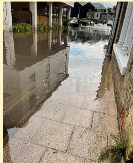
Thetford on Tuesday this week

That said, the allotment is so full of growth that it could be used as a film set for Tarzan in the jungle!