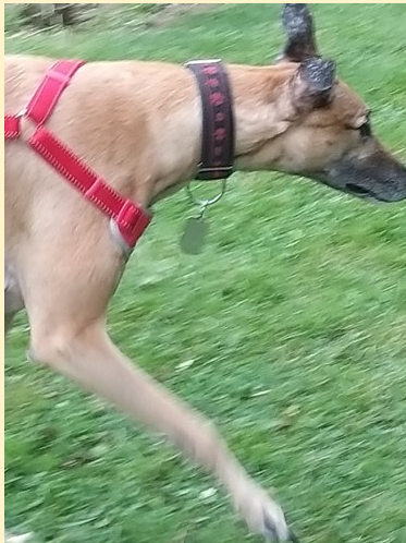
Queenie on full alert

I asked your views last week about the future of these “keeping in touch” communications. Those who have responded all want me to carry on, and tell me how much they enjoy keeping up with news of Queenie the greyhound, and my greenish-fingered efforts with the allotment – so I thought you might like these photographs I managed to capture a few days ago: