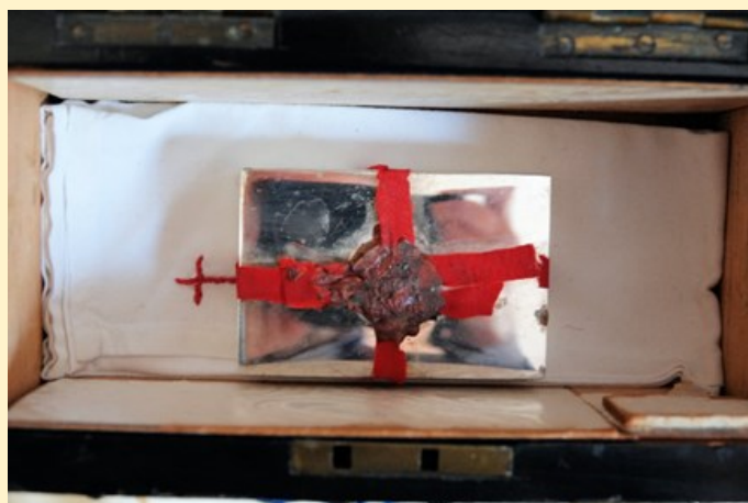
The sealed relic of St Crescentius ready to be sealed in the Altar

The relic which was placed in the Altar as part of the consecration rite is of St. Crescentius of Rome. Crescentius was born of a noble Roman family in 292AD, and was baptized along with his parents by Epigmenius, a Roman priest who was later himself martyred. During the persecutions of Christians by Diocletian, the family fled to Perugia, where his father Euthymius died. Taken back to Rome to stand trial for being a Christian, Crescentius, aged 11, was beheaded on the via Salaria, outside of the city walls.