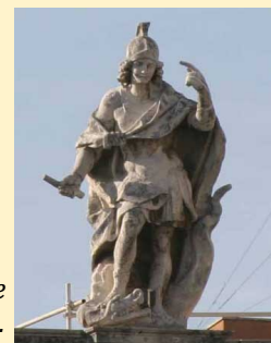
The statue of St Crescentius on the colonnade in St Peter's Square.

https://stpetersbasilica.info/Exterior/Colonnades/Saints-List-Colonnades.htm